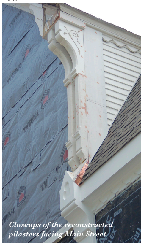
Closeups of the reconstructed pilasters facing Main Street.

If the weather is favorable, the contractor expects to complete the exterior project at the end of the first full week in June. We all look forward to the removal of the green construction fencing and the return of the shrubs and bushes to their original locations. Thank you for your patience as we come to the conclusion of this important upgrade to our church.