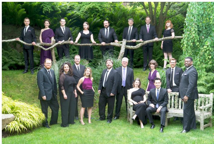
Skylark Vocal Ensemble

I also wish to remind you of the upcoming season of concerts that will be presented at St. Christopher's by Skylark , a Boston-based choral ensemble. You may read all about them, and buy tickets, at www.skylarkensemble.org .