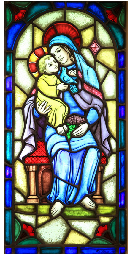
Madonna and Child, Sibley Chapel

In times of trouble like these, may we cling to you, O Christ of infinite mercy, love, and strength!