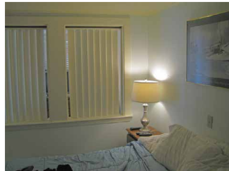
After images showing the custom privacy louvres as well as shelving, a picture, and freshly-painted walls.

The Adopt-A-Unit ministry was the perfect project to kick