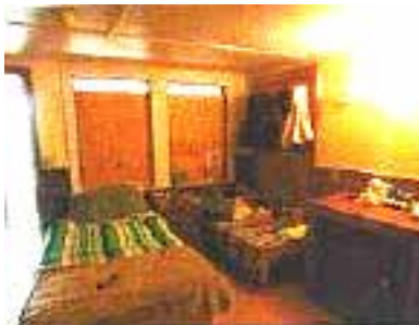
Above: A before image, showing plywood blocking the only light available to the room.

I ask you to imagine yourself needing to move with your three children under the age of seven into a 50-year-old motel room that has no cooking facilities or storage. That is exactly the challenge faced regularly by Safe Harbor residents. Given its limited resources, Safe Harbor finds itself