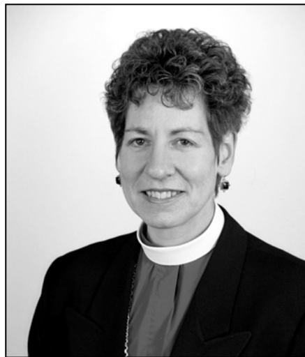
Presiding Bishop The Right Rev. Katharine Jefferts Schori

This gardener has himself been planted and now springs up green