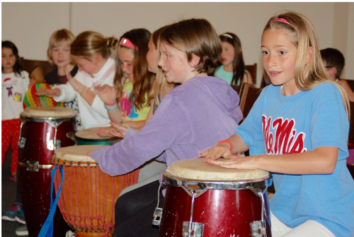
Choristers and guests try out the African drums and other instruments at a rehearsal for African Sunday.

The monastic tradition found the psalms to be of such central importance that it arranged for all 150 psalms to be said or chanted every month. During the first century of the Reformed tradition, only psalms were sung, excluding all of those polluted "man-made" hymns such as those of the liberal Martin Luther.